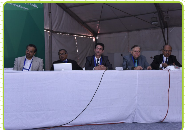
Participants on Symposium on Thyroid Carcinoma in ASICON 2015