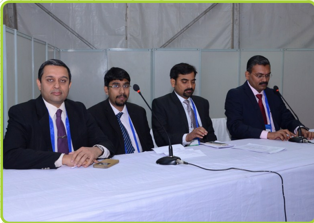
Panel Discussion Team on Management of Complications of Thyroidectomy